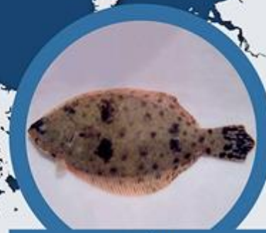
Marine FURG (BR) & Guabi Nutrição Saude Animal (BR)