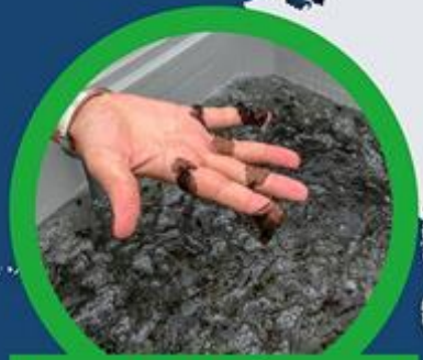
New species CIIMAR (PT) & ALGAPlus (PT)