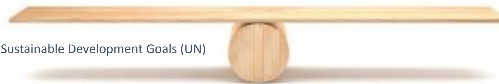
Sustainable Development Goals (UN)