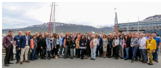
AquaVitae collaborates with the All Atlantic Ocean Research Community