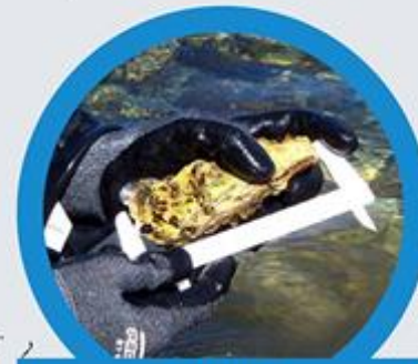
Oysters IVL (SE) & Bohus Havsbruk (SE) & Primar Aquacultura (BR)

The main achievements, discoveries, technological breakthroughs AquaVitae will deliver: 5 value chains, 11 Case Studies (+ 3)